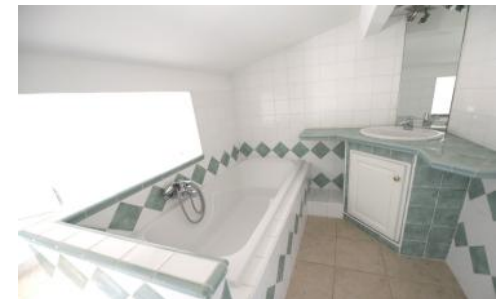
Shower room 3