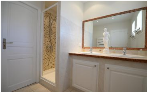
Shower room 1