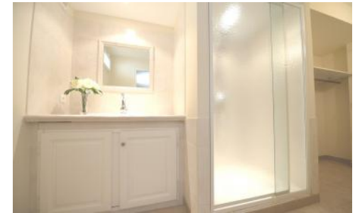
Shower room 4