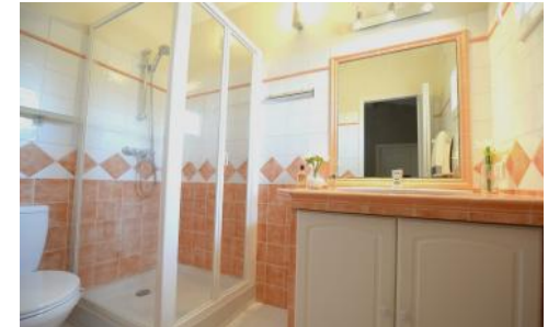
Shower room 2