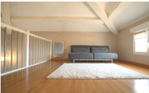
Bedroom 2 mezzanine