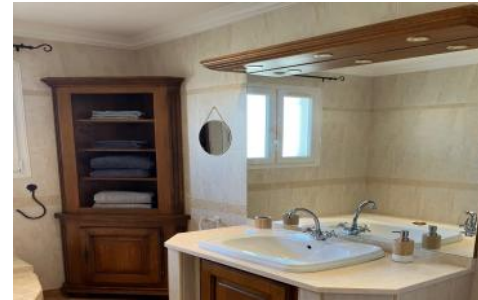
Main bathroom sink