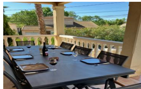
Terrace dining for 8-12