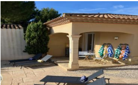
Guest house and sun lounging