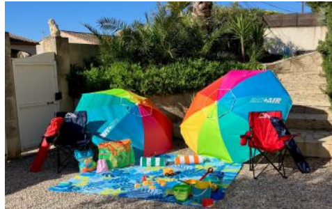
Bring on the beach!