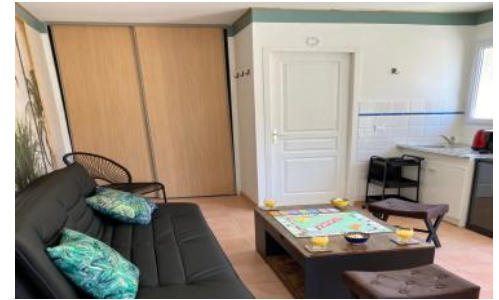
Guest house with bathroom