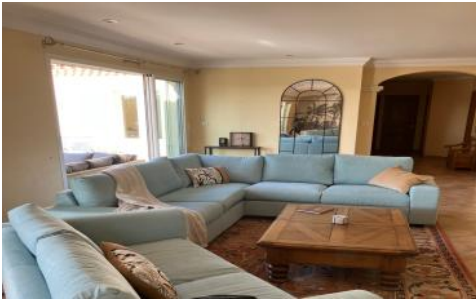
Living room seating