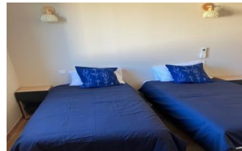
Bdrm2 Single beds or make a King