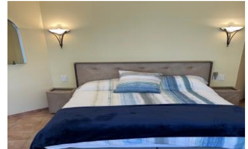
Master bdrm King bed