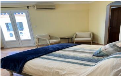
Master bdrm sitting area