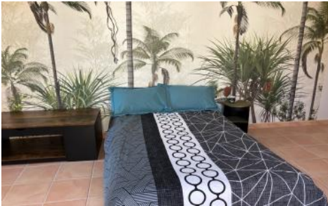
Guest house sofa-bed setup