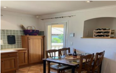
Kitchen dining area