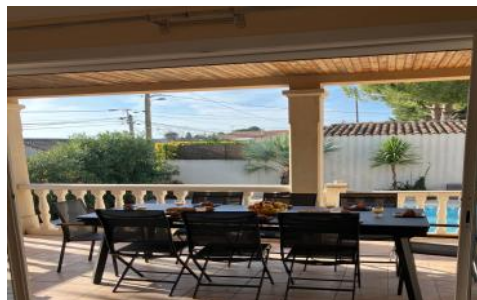
Terrace dining access