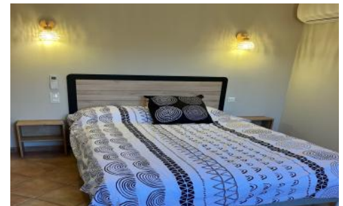
Bdrm3 Queen bed