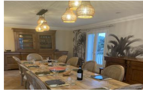
Dining room for 8-10