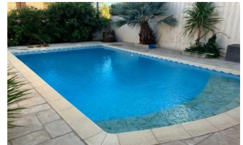
Pool with steps