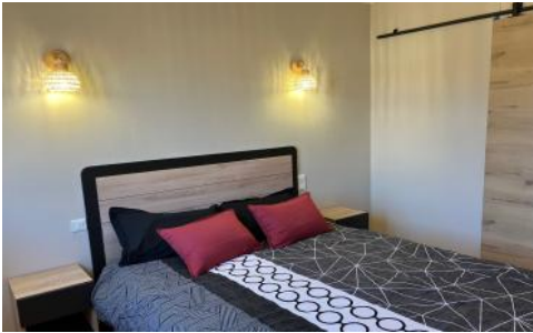
Bdrm4 Queen bed