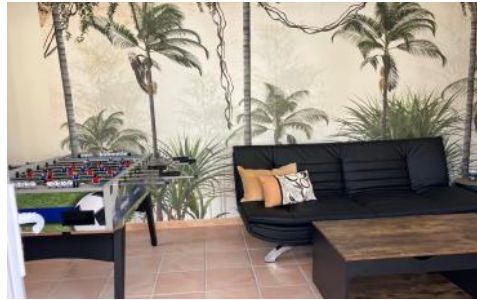
Guest house / Game room