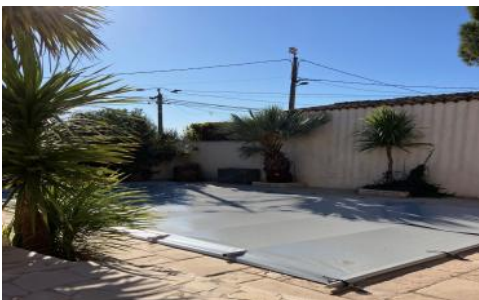
Pool safety cover for children