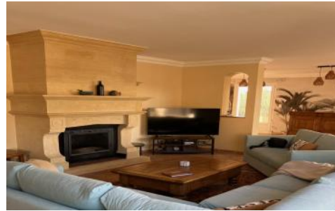
Living room TV watching