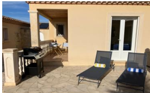
More sun lounging