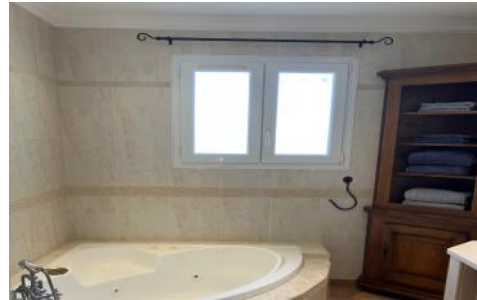
Main bathroom jacuzzi