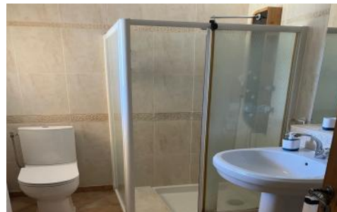
En suite bathroom