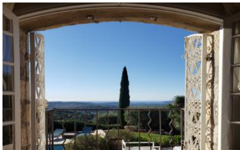
View from Master