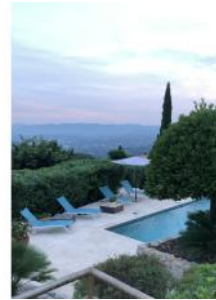
View from Terrace